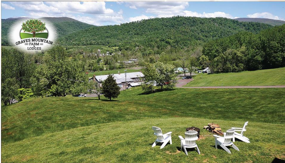
Figure 2 Graves Mountain Lodge

Join us the weekend of September 16-18 as the Virginia State Council of Trout Unlimited holds their Annual meeting. This meeting is open to all members who wish to attend. This year the meeting is being held at the Graves Mountain Lodge in Syria, VA.