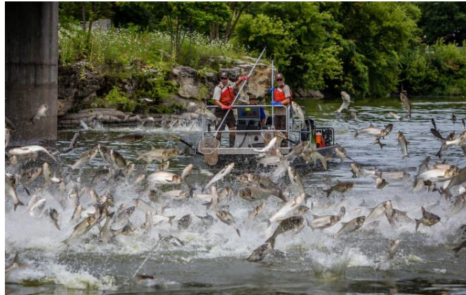
Working to control invasive Asian carp in the Midwest.

As the Chair for the National Leadership Council Native Trout Workgroup, I learned that invasive fish species are a serious threat to other fish species from Maine into the Midwest and across the nation to Washington. In Virginia invasive fish species include the northern-snakehead and Alabama bass.