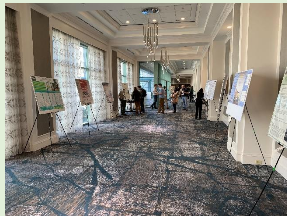
Workshop on reconnecting aquatic habitat. University student's research project posters.

Workshops were generally presented by experienced fisheries biologists, university professors, and industry professionals. Technical sessions were expertly presented by university students assisted by professors. The author attended workshops on Problematic Aquatic Plants and Aquatic Connectivity. The author also attended 10 technical session topics that included Brook Trout Genetic Data, Creel Surveys and Angler Attitude, Aquatic Connectivity, Climate Change, and Techniques, for example electrofishing.