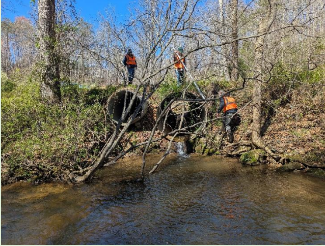
Culverts that empty into Mill Creek near Reynolds Mill.