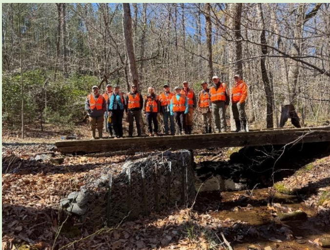
Group photo on a bridge in Reynolds Homestead.

The next Virginia Trout Stream Barrier Survey training session will be held in the fall 2026. The date will be announced.